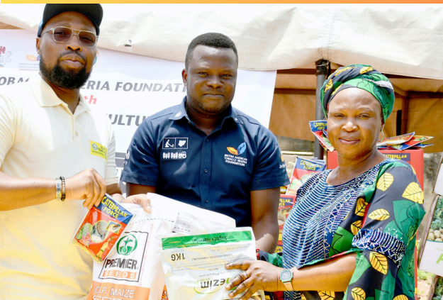
BATNF Foundation and Ogun State Ministry of Agriculture Unite to Empower Maize Farmers