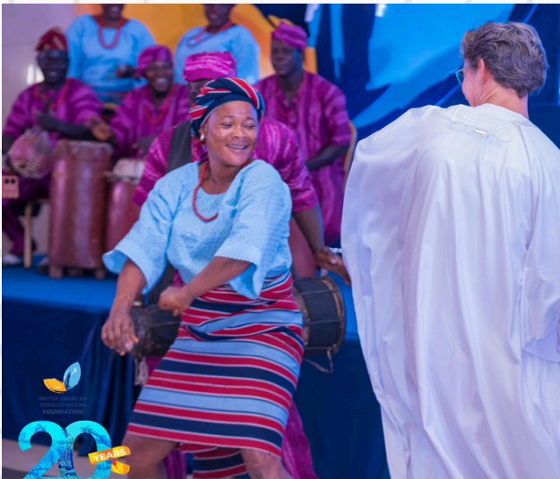
BATNF @ 20 CELEBRATION

AGRICULTURAL DEVELOPMENT- ADVOCACY- COMMUNITY DEVELOPMENT