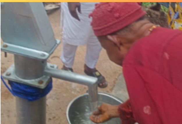
Bringing Clean Water to Ndeabor, ENUGU