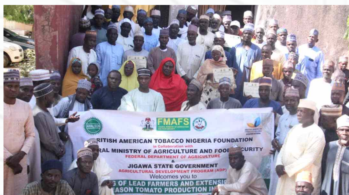
Jigawa state training