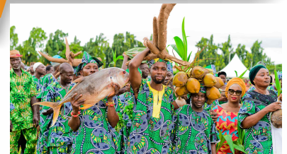
Lagos Farm Fair