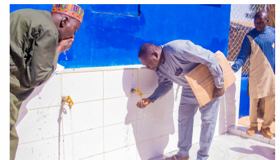
Water is life and flows in Sangaru Village