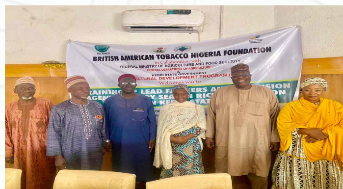
Niger state training