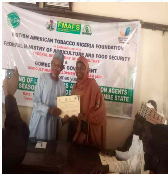
Gombe state training

The training regimen, conducted concurrently across the four states encompassed a diverse array of topics essential for enhancing agricultural productivity and sustainability. The program was meticulously designed to achieve multifaceted objectives, including the enhancement of technical competencies in crop management, post-harvest handling, and value addition. Moreover, it aimed to foster innovation, promote sustainable farming practices, and facilitate access to lucrative markets for farmers. The curriculum was meticulously structured, comprising technical training sessions covering agricultural techniques, value addition strategies, entrepreneurship, and practical field demonstrations. Furthermore,