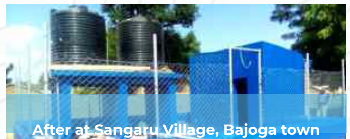
After at Sangaru Village, Bajoga town

source has unlocked new opportunities for economic growth, allowing the community members to invest more time in education and entrepreneurial ventures.