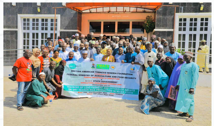
Niger state training