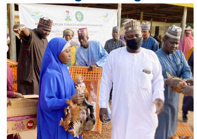
BATN Foundation empowers 300 women in Bauchi