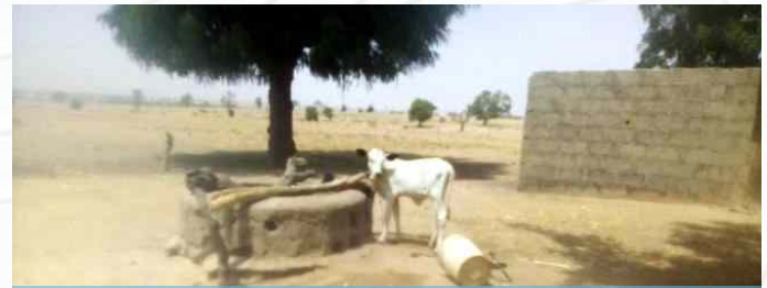
Before at Garin Jummi town

Economic Empowerment: the newfound water