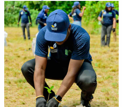
BATNF champions environmental sustainability