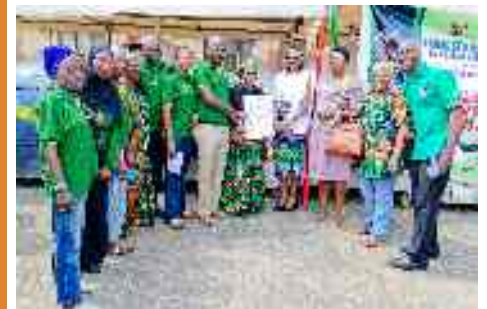
Fish Farmers Benefit from the Fingerlings to Fork programme