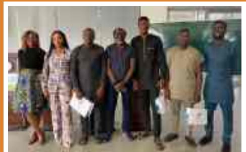
DBS Wins Golden Buzzer Challenge