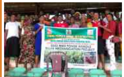
Making A Difference in Ebonyi State