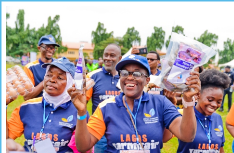
2022 World Food Day Celebration