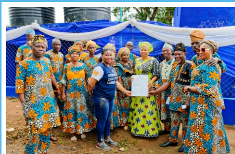
Adugan Community Gets Solar-Powered Borehole