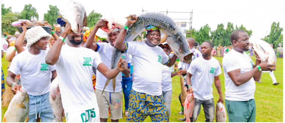
Fish Farmers parading their products at the Lagos Farm Fair.

The carnival-like occasion served as a day of appreciation of farmers as farmers and other stakeholders in the various value chains in the agriculture sector were honoured and celebrated by the Lagos state government for braving the odds in ensuring food availability in the State and the country at large.