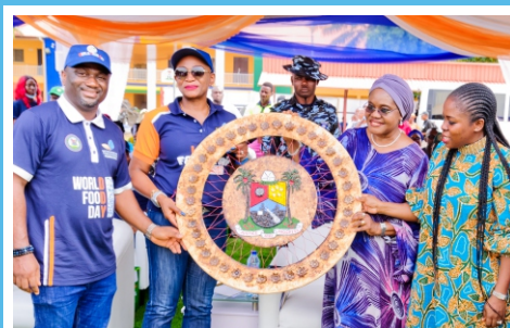
BATNF Receives Award of Recognition