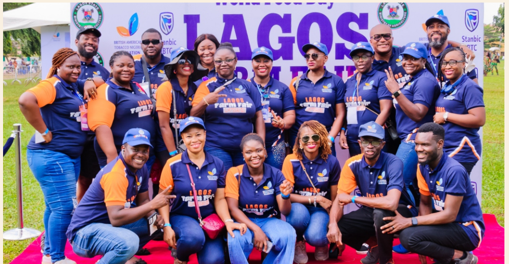
BATN Foundation staff and volunteers at the Lagos Farm Fair

"We will continue to do this even more in the future. With the private sector support and the commitment of the government, there is no better time than now, for all players in the agricultural sector to come together to develop and implement a strategy that is deliberate and consistent, in ending all forms of hunger and malnutrition and more importantly is one that creates increased opportunities for our farmers to thrive sustainably".