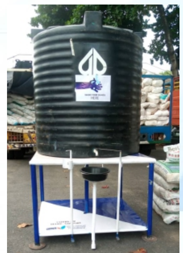
Mobile contactless hand wash station