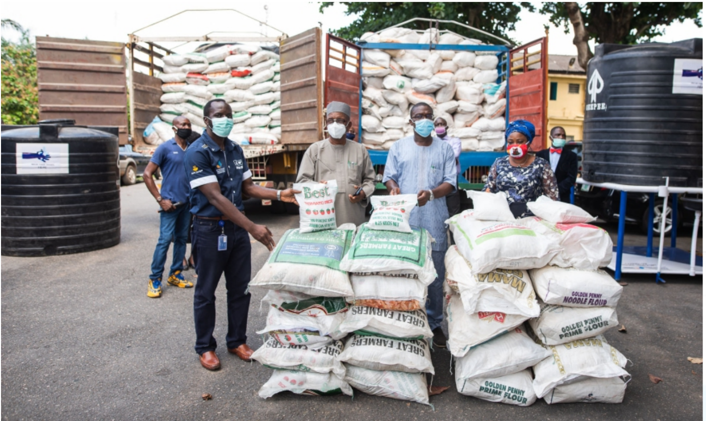
Representative of the British American Tobacco Nigeria Foundation donating the items to Oyo state Government.

The COVID-19 pandemic has given rise to a lot of unprecedented government and private interventions and British American Tobacco Nigeria Foundation also played a part in the fight against the spread of the virus with a donation of relief materials worth over ₦35 million to Lagos and Oyo state governments.