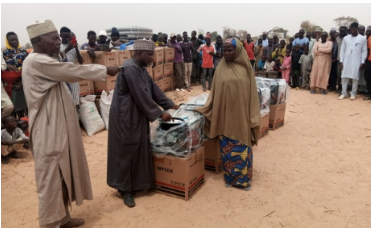
Farmers receiving irrigation equipment from BATN Foundation implementing partner, Green Sahel And Rural Development Initiative

I was able to farm in the dry season. Now I have sold my paddy and settled all my debts.