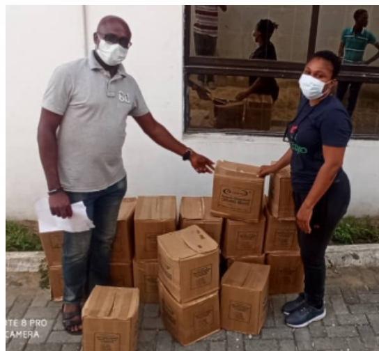
Lagos emergency Agency receiving hand sanitisers from BATN Foundation

With this donation, the Foundation hopes to support the feeding of at least 6,000 indigent households (with a bag of rice and garri each) and provide preventive support to health workers in the State's isolation centres, with the facility to wash their hands regularly.