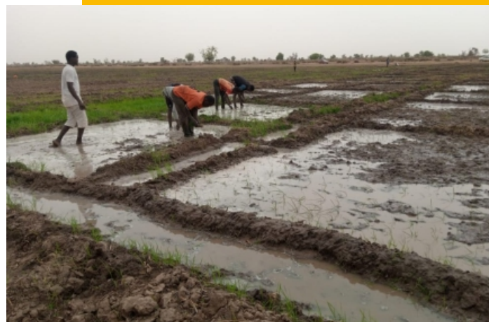
Beneficiaries of the BATN Foundation intervention working on their rice plantation.