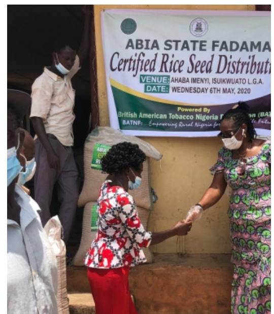
Farmers receiving rice seeds from BATN Foundation implementing partner, Abia State FADAMA