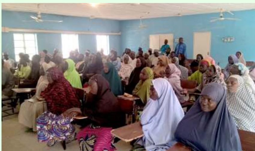
Beneficiary maize farmers during training session at Kadawa Community of Garin Mallam Local Government Area of Kano State.