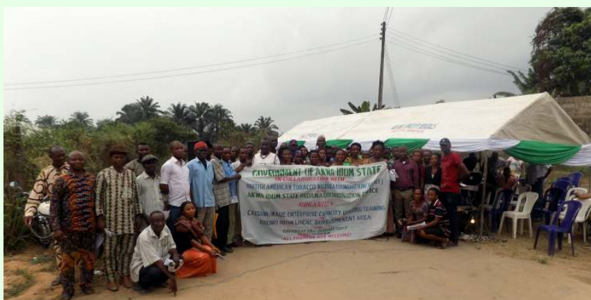
Beneficiary cassava and maize farmers in a group photograph after the training program at Iyang Community, Ibiono Ibom Local Government Area of Akwa Ibom State.