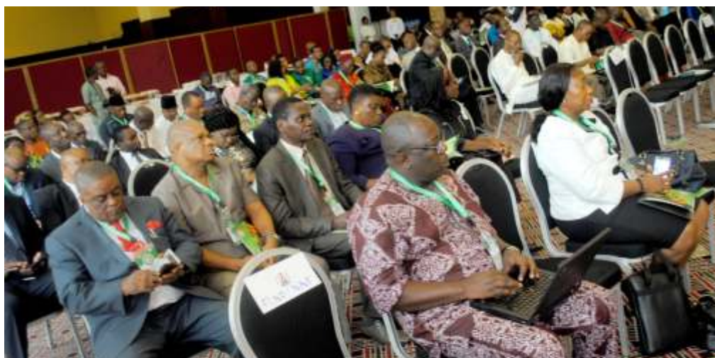
Stakeholders during the Summit.

He made it known that BATNF is presently supporting smallholders farmers in the state through the Maize & Cassava Capacity Building Project and assured the participants of BATNF continuous support on the project in the next 2 years provided the state government is ready to make contribution in kind or cash towards the project that may be planned for the state.