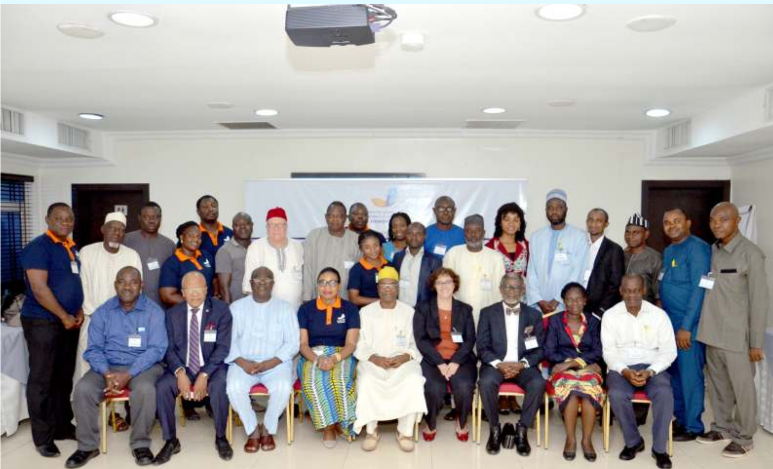
Implementing partners and other key stakeholders at the Workshop.