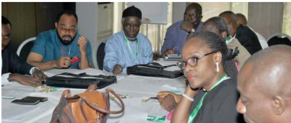
A syndicate group in session at the Summit.