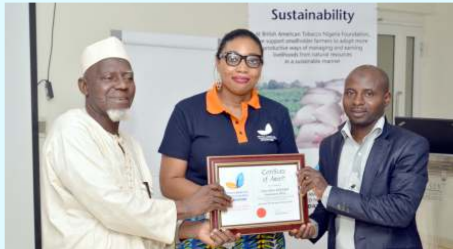
Presentation of the Most Outstanding Implementing Partner Award certificate for the 2016-2017 farming season to Niger State ADP representatives.