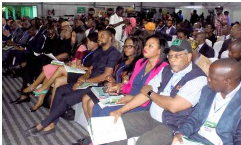
Participants at the Summit.