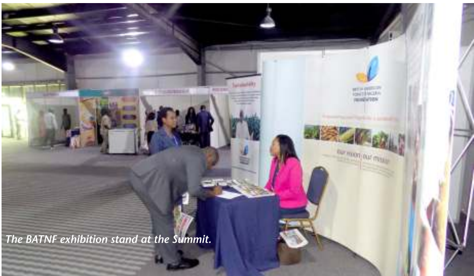
The BATNF exhibition stand at the Summit.