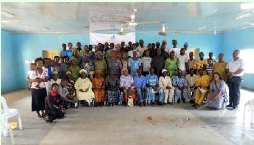
Group photograph of the beneficiaries after the training session at Epe Division.