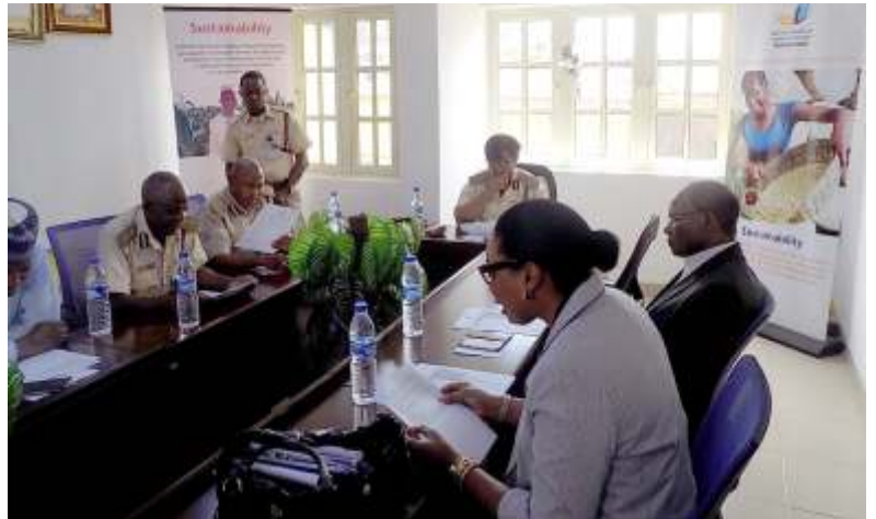
Dignitaries inside the NIS Conference Room during the official handing over ceremony.

The Waiting Room is upgraded with: an expansion of its size; provision of 150 units of plastic chairs; provision of 4 units of electric standing fans; supply and installation of a 40-inch colour television; ceiling of the roof with PVC; supply & installation of DSTV with 5 months' subscription, a generating set and tiling of the floor with ceramic tiles.