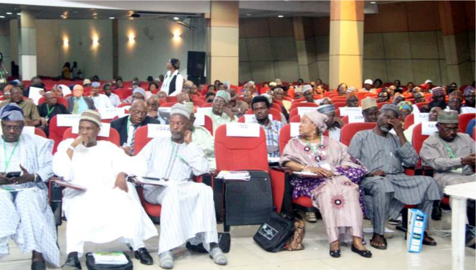
Participants during the Meeting.