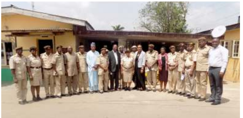
Group photograph with the NIS officials after the handing over ceremony.