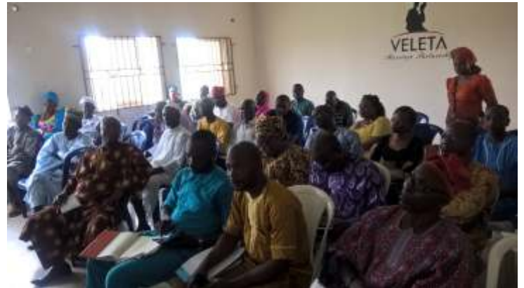
Representatives of beneficiary groups at the meeting.

35 smallholder fish farmers representing the identified 50 farmers group cutting across the fish value-chain from Epe, Ikorodu and Badagry Divisions were present at the stakeholders meeting.