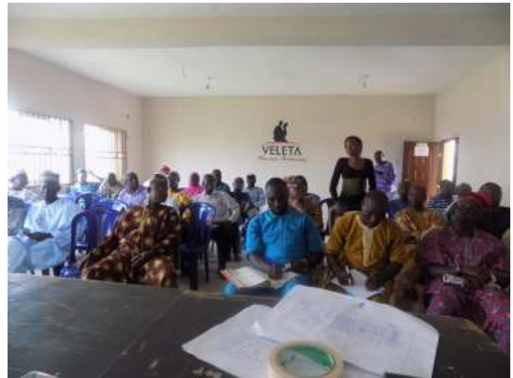
Another section of representatives of beneficiary groups at the meeting.