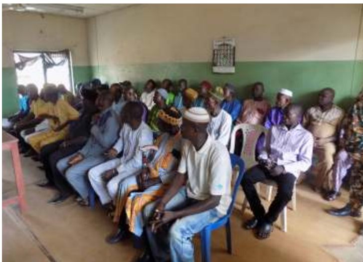
Stakeholders during the meeting.

The project which focused on best agricultural practices in dry-season rice production, will train 300 lead farmers from identified 150 groups of smallholder rice farmers and other actors in the value-chain in land preparation, procurement of high-yield disease resistant rice seeds, nursery preparation, trans-planting, spacing & weeding techniques, applications of organic & chemical fertilisers, application of aflasafe, water management, harvesting, post-harvesting handling, book keeping, group dynamics & management, linkages to open and institutional markets. It will also avail the beneficiaries with training opportunities in cultivation of