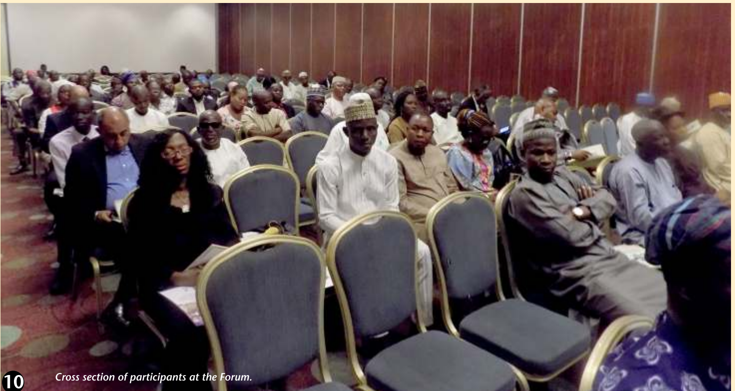
Cross section of participants at the Forum.