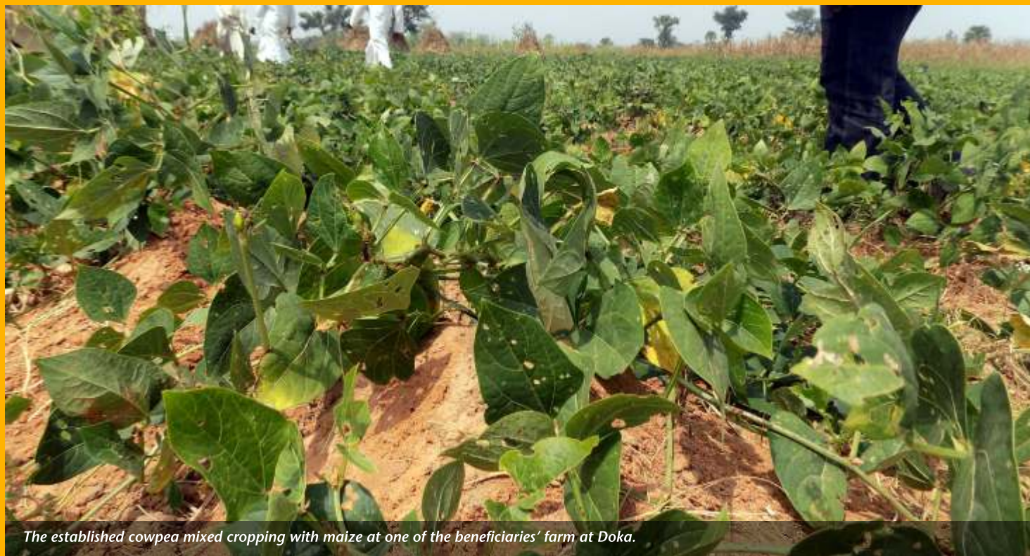
The established cowpea mixed cropping with maize at one of the beneficiaries' farm at Doka.

The third in the series of media tours of the British American Tobacco Nigeria Foundation's established model farms across the country took place on Thursday, 20th October 2016 with a visit to the farms of project beneficiaries at Bizara and Doka Communities in Zaria North Local Government Area of Kaduna State.