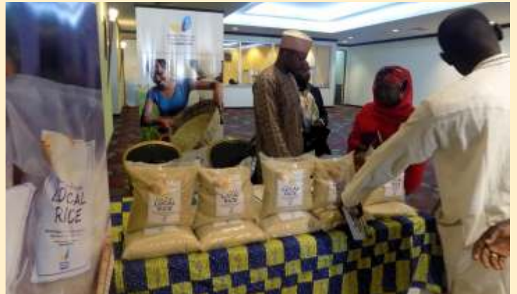
The BATNF exhibition stand at the Forum.

Over 500 participants across the rice value-chain in the country attended the 2-day Forum.