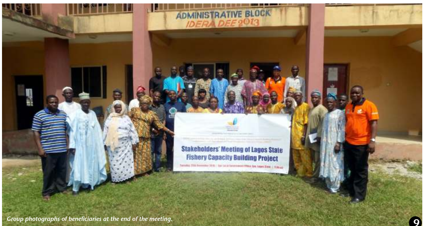
Group photographs of beneficiaries at the end of the meeting.