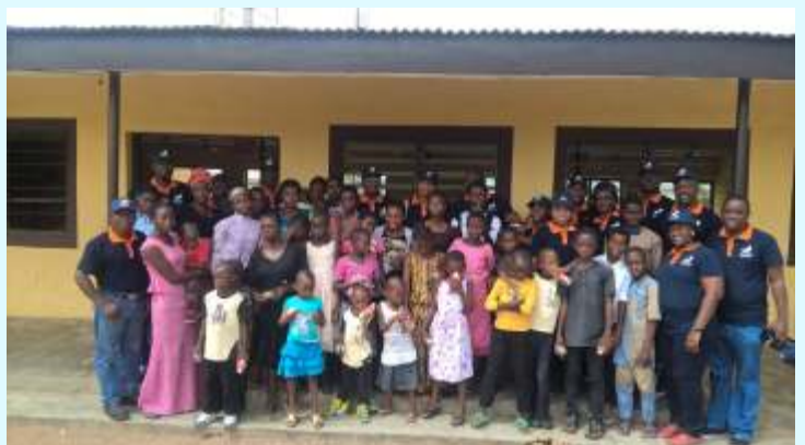
Group photograph of the volunteers with the residents of the Home.