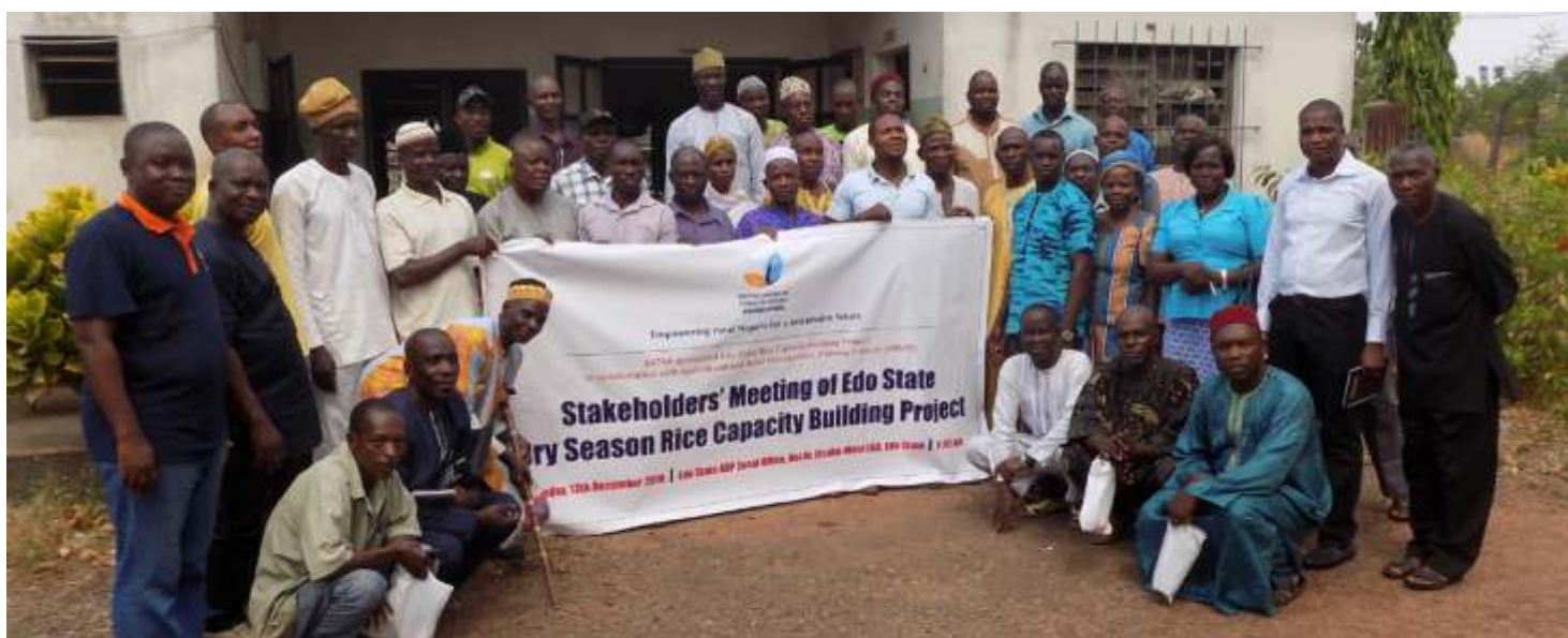
Stakeholders in a group photograph after the meeting.

Agricultural and Rural Management Training Institute (ARMTI), a capacity building agency of the Federal Ministry of Agriculture and Rural Development is the technical partner of the 1-year project.