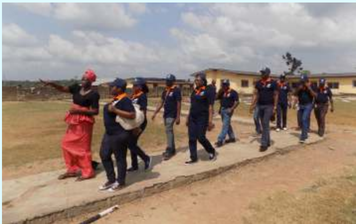
Facility tour of the Home.