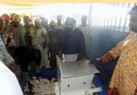
Demonstration of cassava grater during the event.