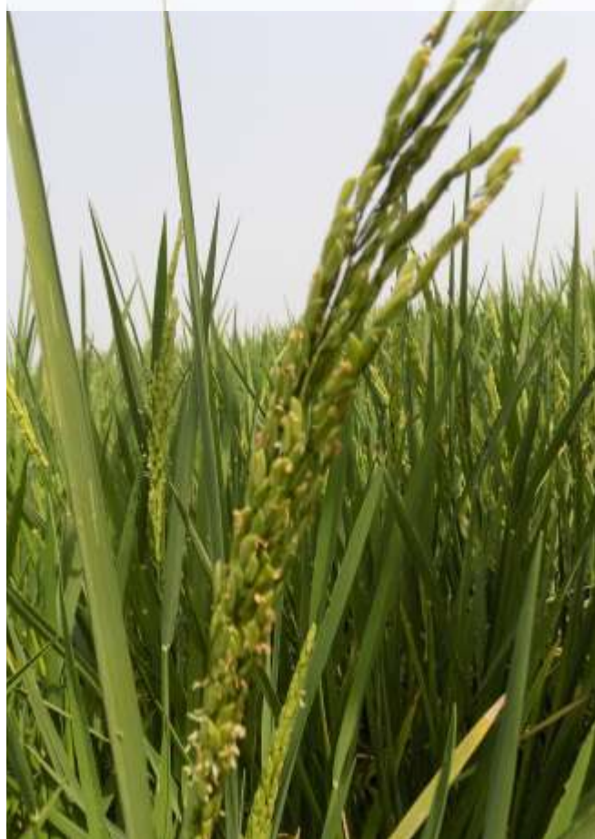
Matured rice on the established field during the visit.