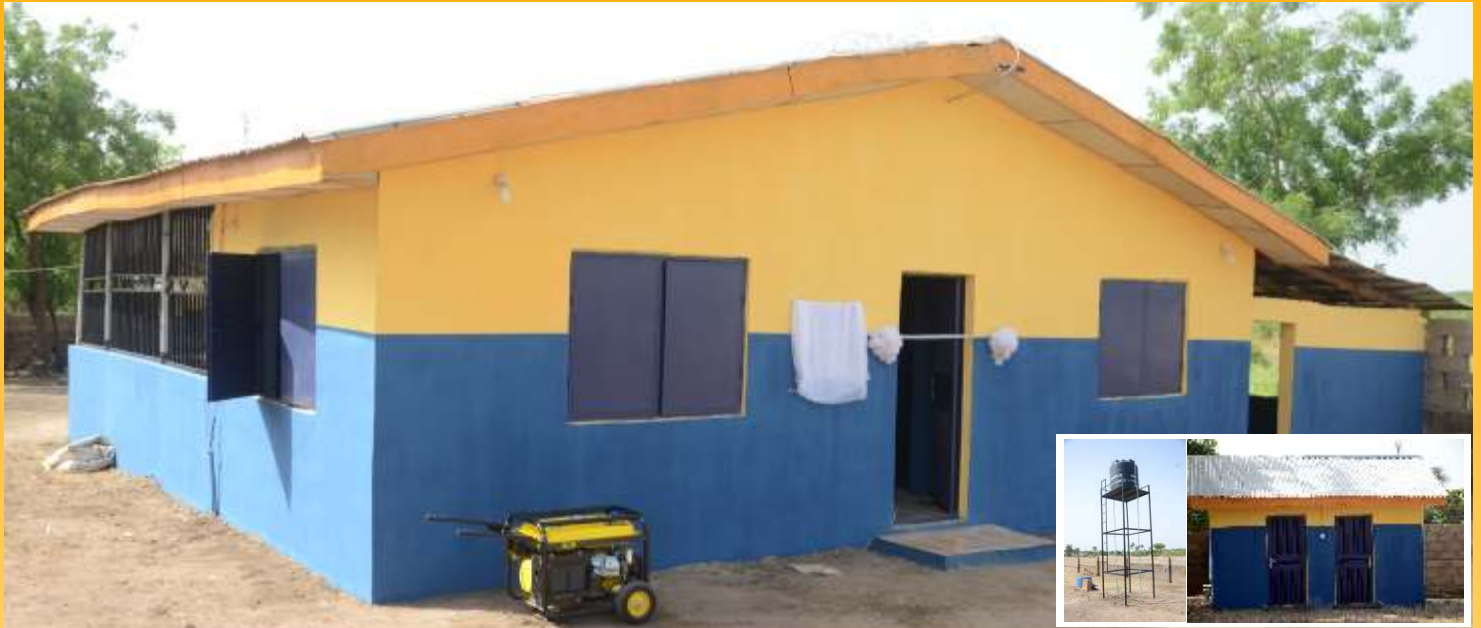
The rehabilitated cassava processing cottage Industry. Insert are the water and sanitary facilities provided to improve hygiene at the industry and serve the community.