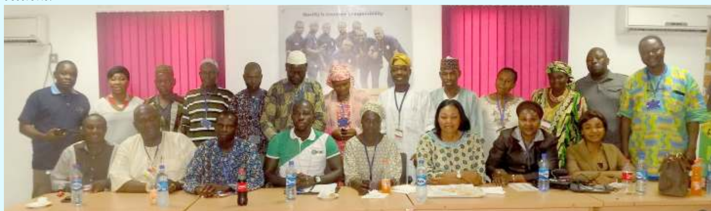
Participants at the meeting with Canadian Fund in Ibadan.