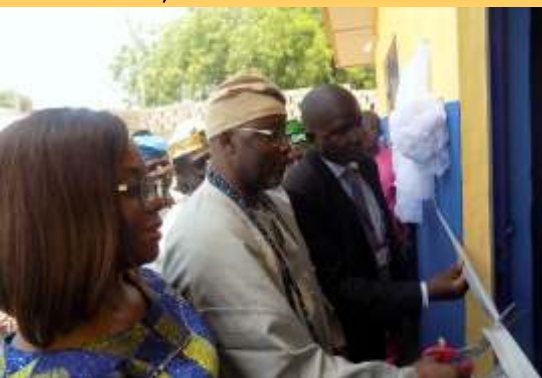
Oba Abodunrin Oyetunji declaring open the rehabilitated cottage industry.