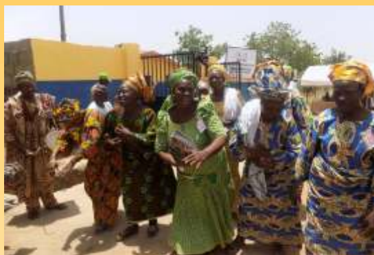
The community members in a joyous mood at the event.