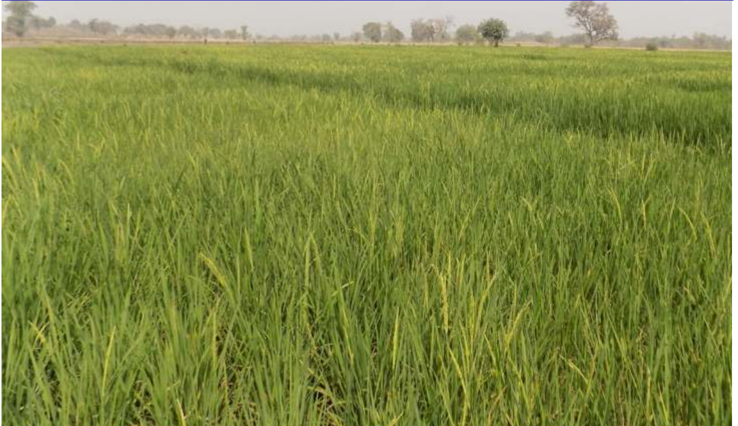
A section of established 10 hectares irrigated rice farm at Gaba-Doko Community during the visit.