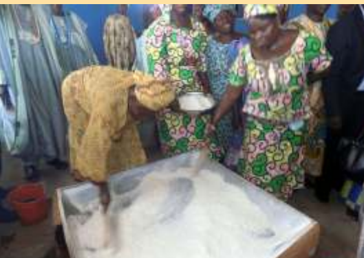
Demonstration of cassava fryer during the event.