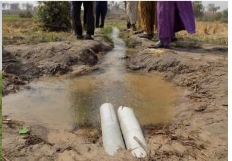
The irrigation system of the rice farm.