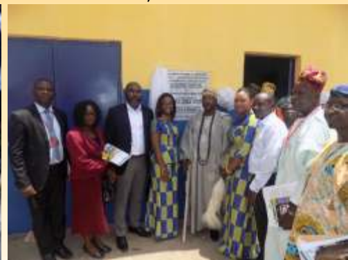
Dignitaries after the commissioning of the project.