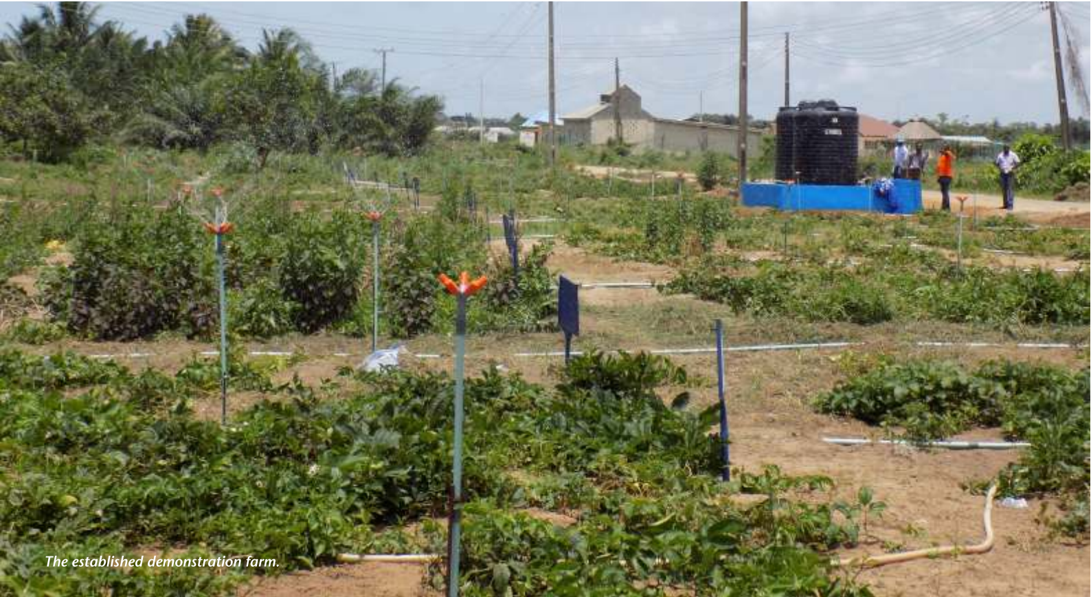
The established demonstration farm.