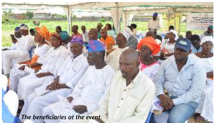
The beneficiaries at the event.