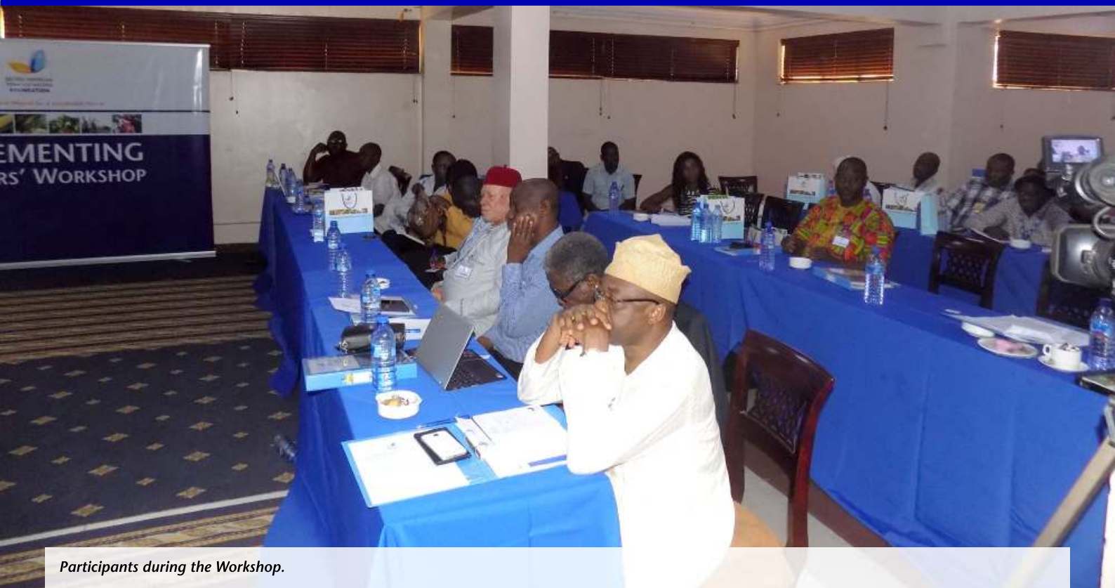
Participants during the Workshop.