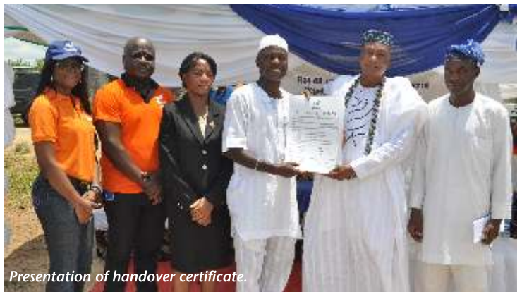
Presentation of handover certificate.

With the installed irrigation facility, the Ewebe FADAMA Users Group can produce vegetables both during the rainy and dry seasons.