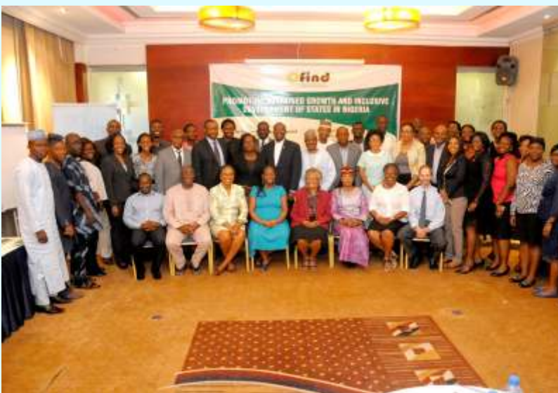
Participants at the Dialogue.