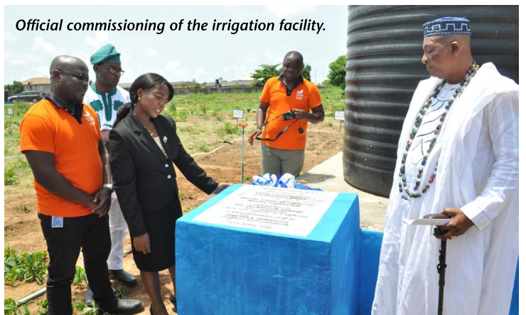
Official commissioning of the irrigation facility.