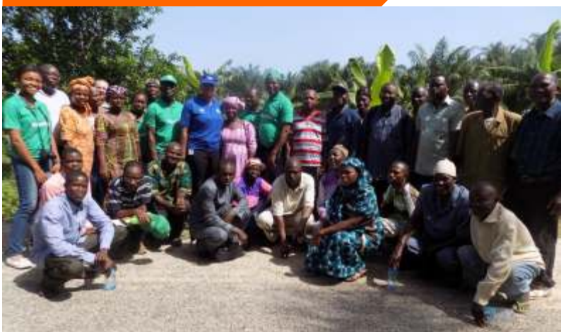
MicroVeg Team, BATNF team and the farmers in a group photograph.